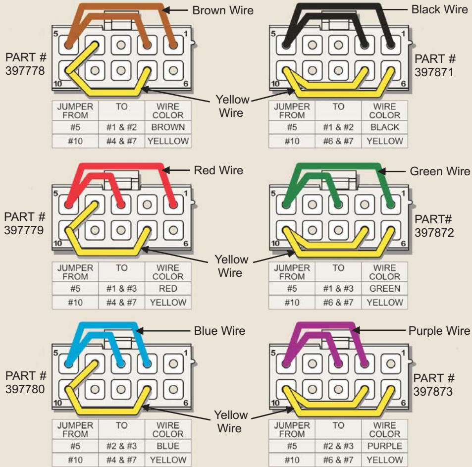
FIGURE 2: 97%+ ID Plug Wire Reference